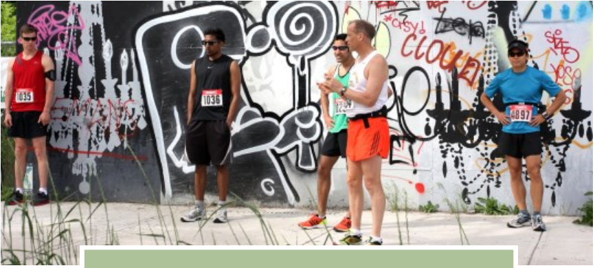
Oasis Spring Run Participants